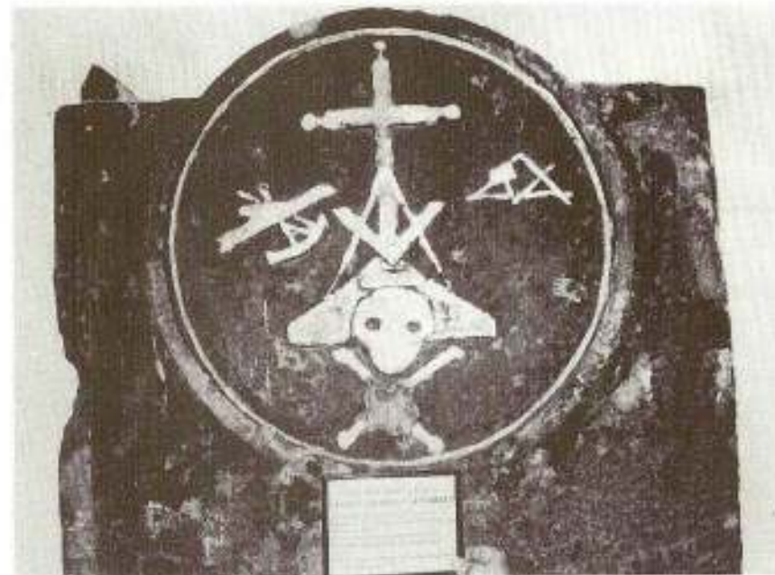
Photograph of Major Charles Shirreff's tombstone, now situated in the entrance of the North Shropshire Masonic Temple.