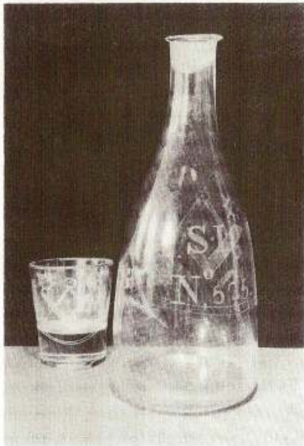
Decanter and Firing Glass, pre-1792.